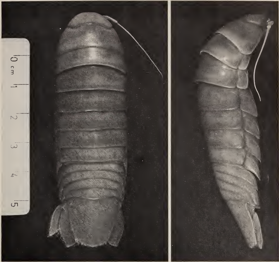
Fig. 1. Parabathynomus natalensis . Holotype in dorsal and lateral view.

Maxilliped endite triangular in cross-section, with two coupling hooks and about six plumose setae distally; palp five-segmented, third segment longest and broadest, all segments fringed with setae.